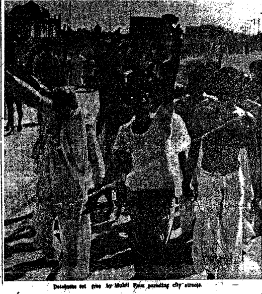
Delights are seen by Mukti Bahini parading city streets.

It may be recalled that A.A.K. Niazi the Chief of the Occupation Forces, had earlier stated that he would fight to the last. This was said by him while he was giving a speech regarding the speed of Major General Rao Farman Ali, the Adviser on Civilian Affairs to the Occupation Forces, to the United Nations for mass killing, massacre and execution of the Occupation Forces and West Pakistan officers to West Pakistan. Niazi at that time stated that the Allied Forces and Mukti