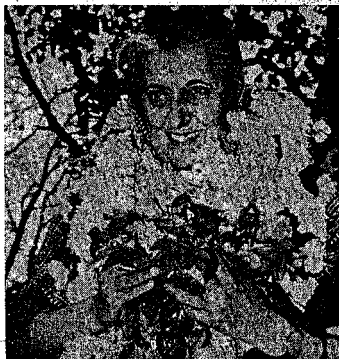
Mr. Indira Gandhi

Tajuddin Ahmad, Prime Minister of Bangladesh in a radio broadcast over the Bangladesh Radio Kendra has advised the people of Bangladesh not to take law into their own hands. In this connection he also has said that the collaborators and the conspirators would be tried in course of time. He has also said that the task of reconstruction and rebuilding must start forthwith.