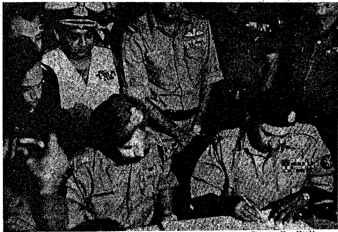
Niazi signs the document of surrender while Lt. Gen. Aurora looks on.

7) Law and order must not be taken by any individual or groups of individuals. Anybody committing any offence or any excess thereof should be handed over to proper local authority of the Government of the People's Republic of Bangladesh. Joy Bangla.