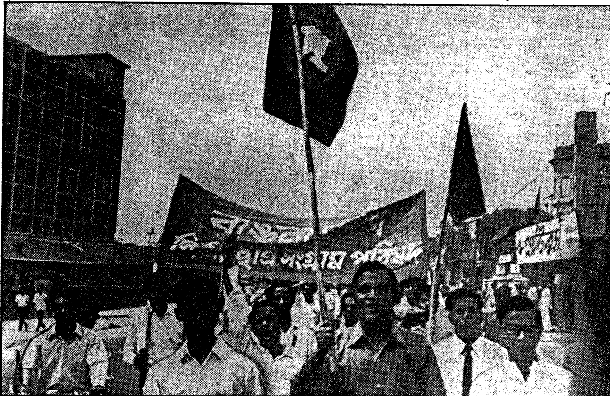
Students displaying East Pakistan's 'Flag of Independence' parade in a 'No compromise with President Yahya Khan' demonstration in Dacca.