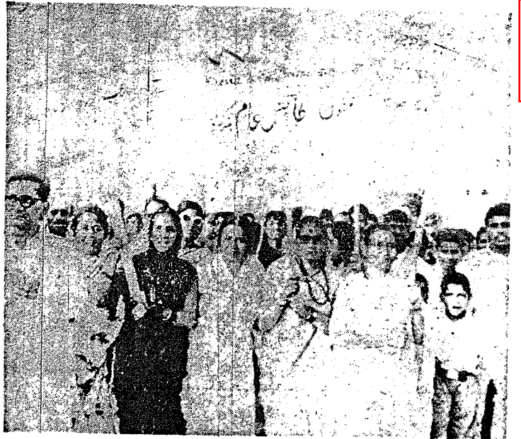
Indian supporters of breakaway East Pakistan demonstrate outside the Pakistan embassy in New Delhi to protest the reported massacre of thousands in East Pakistan.